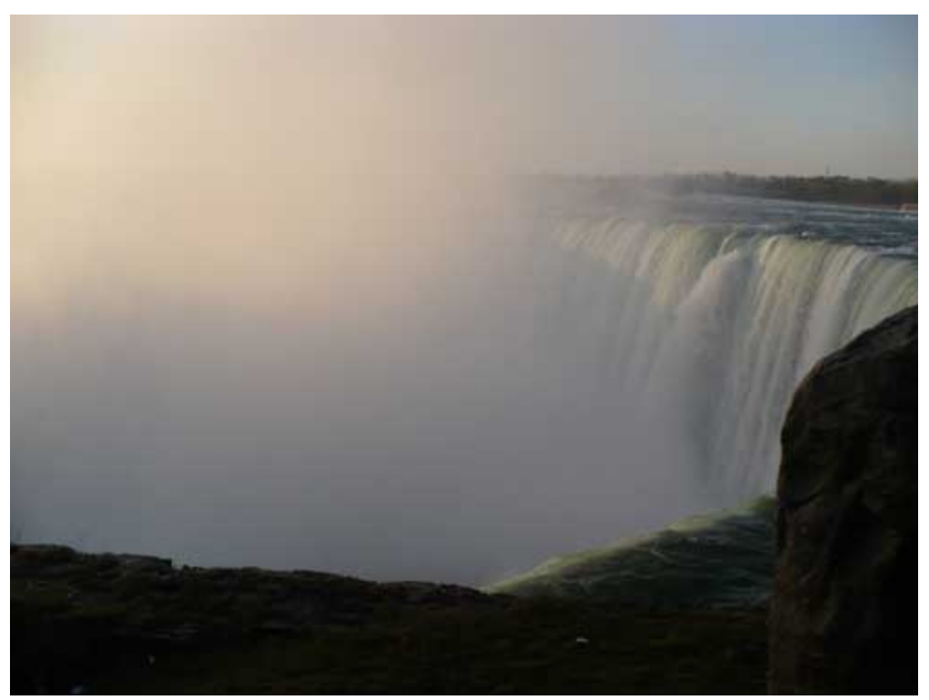
The living entities in the land, sea, and sky of Niagra Falls getting purified by the glance of the pure devotee, and by the atoms of prema emanating from the pores of his divine body. *[See endnote 2]

[*Endnote 1: "These verses were originally composed and sung by Ramananda Raya himself. Srila Bhaktivinoda Thakura suggests that during the time of conjugal enjoyment, the attachment might be compared to Cupid himself. However, during the period of separation, Cupid becomes a messenger of highly elevated love. This is called prema-vilasa-vivarta. When there is separation, conjugal enjoyment itself acts