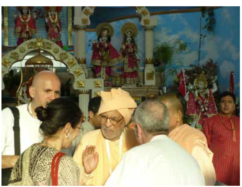
Offering blessings before leaving the temple