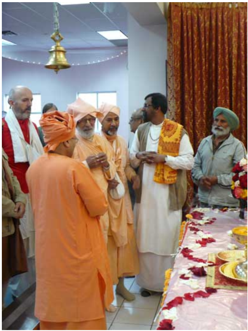
Greeted by the pujari and other staff at the Hindu Mandir